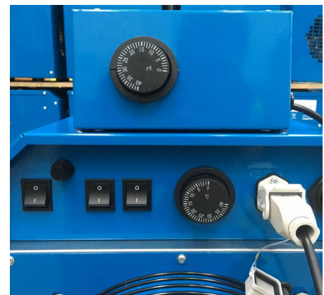
Easy to use controls, including fan & heat settings, over temperature reset and remote thermostat port