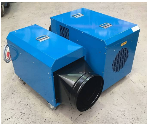
FFHT32 compared to the FF29