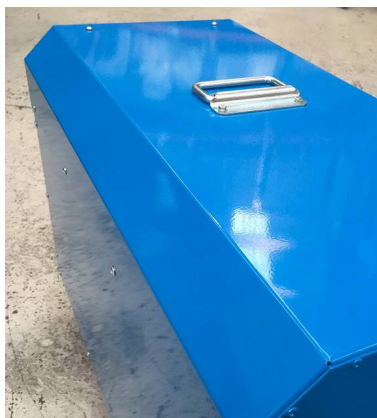
Contoured stylish design