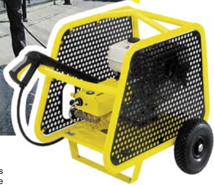
Petrol and diesel versions.

High-pressure cleaners that provide the power professionals need. Available with either a 13.0 HP four-stroke petrol engine or an electrically started diesel engine, the HD 1050 Cage gives you outstanding performance independently of an electric supply.