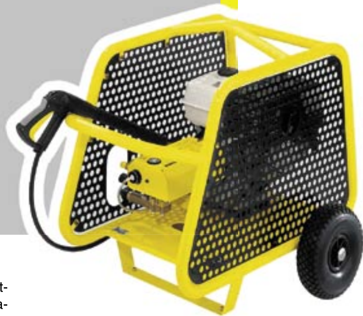
Petrol and diesel versions.