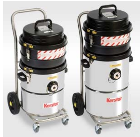
Type H KAV 30, KAV 45