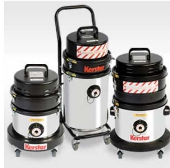
Type H KAV 15, KAV 18, KAV 20