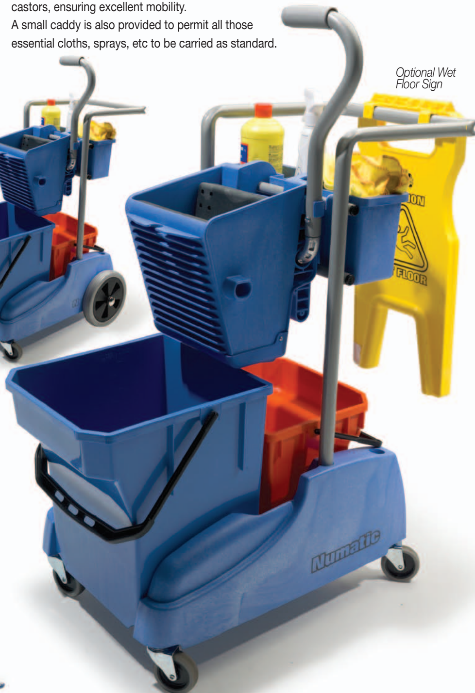
Optional Wet Floor Sign