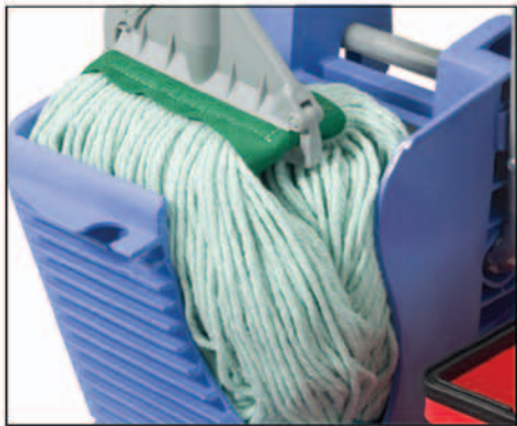
High Efficiency AllMops Press