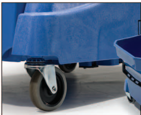
75mm Non-Marking Castors