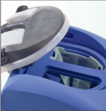
Filtered dirty water tank