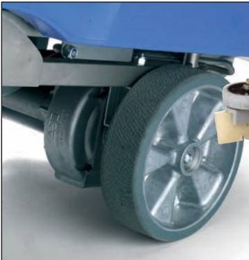
Heavy duty power drive