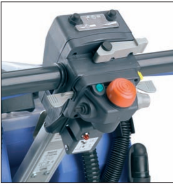
Central control system