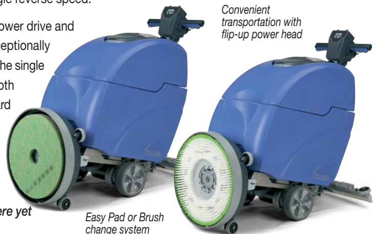
Convenient transportation with flip-up power head

The enhanced operating speed and performance really does make a small machine do a big job. Small enough to go anywhere yet big enough to go everywhere.