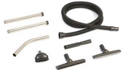
38mm Wet and Dry Anti-Static Vacuum Tool Kit