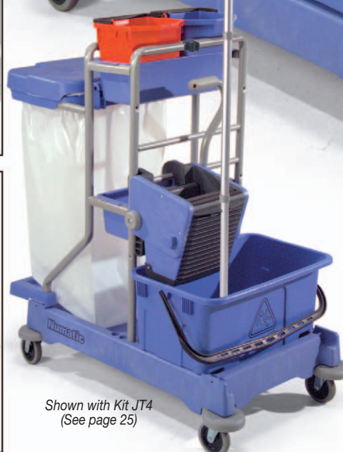
Shown with Kit JT4 (See page 25)