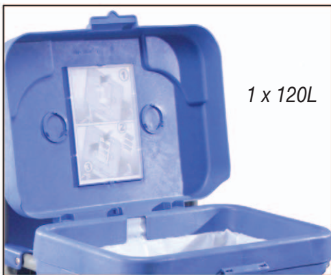
1 x 120L