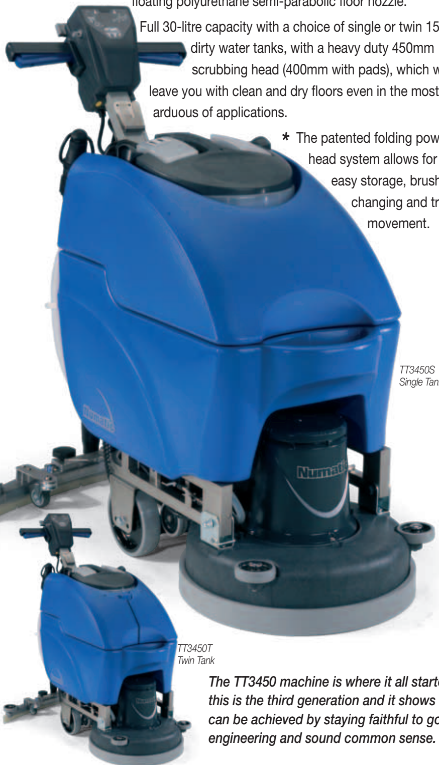
TT3450S Single Tank