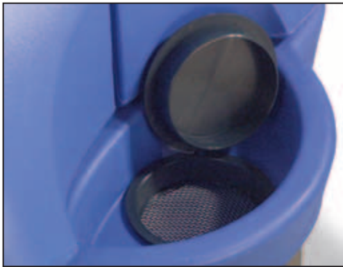
Easy Tank-Filling Access