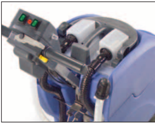
Simple to Use Operator Handle

* The patented folding power head system allows for both easy storage, brush changing and transit movement.