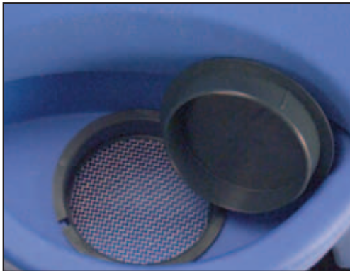
Easy Tank-Filling Access