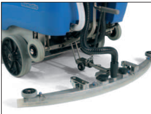
Wet Pick-Up Squeegee