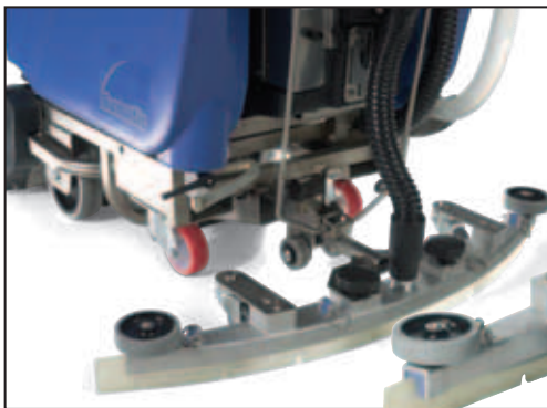
Wet Pick-Up Squeegee