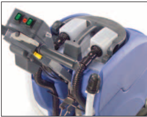
Simple to Use Operator Handle

Easy to fill... easy to empty... easy to charge... easy to use, and, at the end of the day, easy to see the exceptional results.