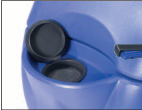
Easy Tank-Filling Access