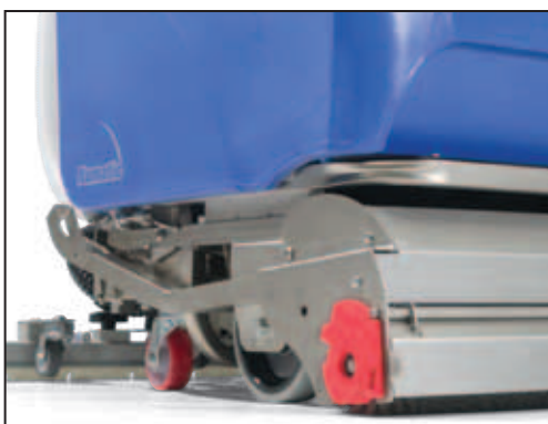
Stainless Steel Chassis and Brush Head