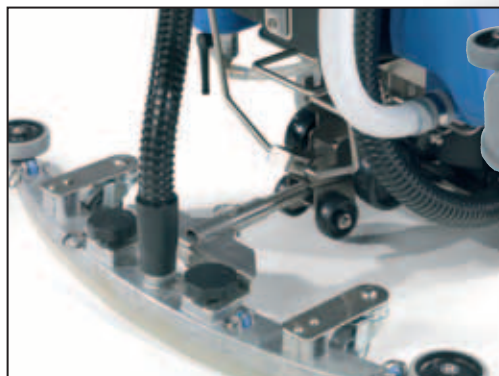
Wet Pick-Up Squeegee