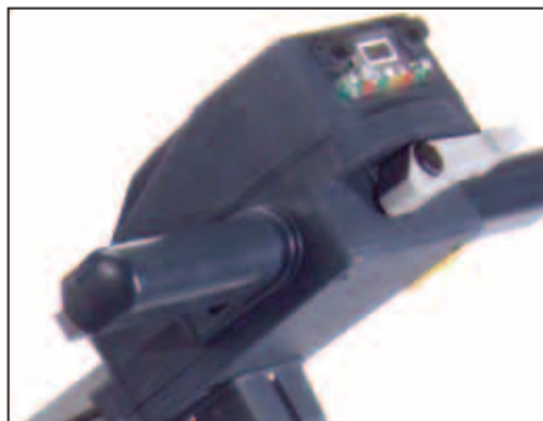
Simple to Use Operator Handle

The TTB4552S really does pack more innovation, performance and usability into one machine than most.