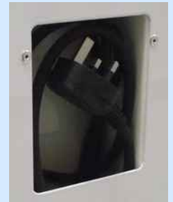
Recessed Cable Pocket