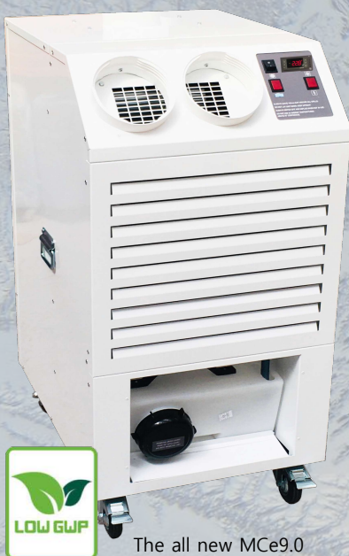
The all new MCe9.0

In addition to the environmental credentials the MCe9.0 delivers unrivalled performance. 9kW of cooling from a standard 13A supply and powerful backward curved fans that can exhaust warm air over 10m through of lightweight, standard 200mm ducting that's much easier to handle and store than some of the 300-400mm duct that's commonly used. Also featuring fully adjustable airflow, digital thermostatic control, auto shut off and indicator light when the condensate tank is full and lockable castors for easy manoeuvrability the MCe9.0 is probably the most powerful and versatile portable air conditioner on the market.