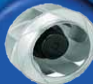
HIGH CAPACITY EC FAN