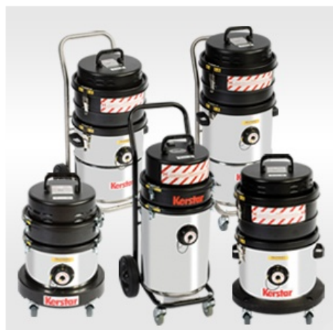
Type H Industrial Cleaners: KAV 15-45 Type H