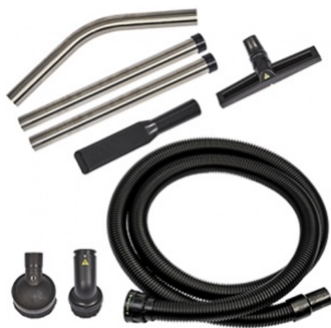
38mm D1 AS Dry Vac Anti Static Toolkit