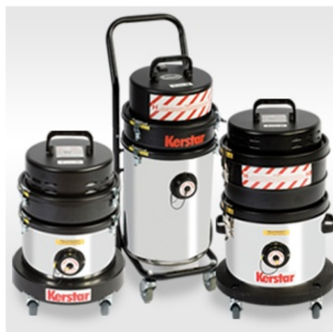
Type H KAV 15, KAV 18, KAV 20