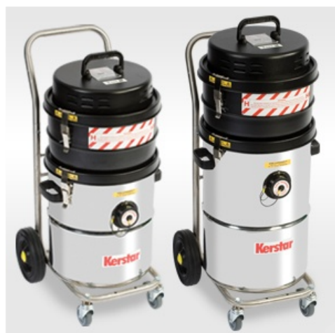
Type H KAV 30, KAV 45