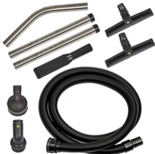
38mm WD1 AS Wet and Dry Vac Anti Static Tool Kit