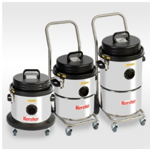
KAV 20, 30 & 45