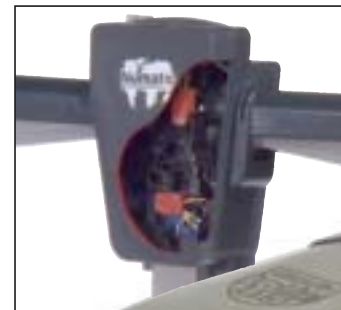
Operator control centre

With the increasing demand and need for higher standards of cleanliness, the Lolines will put truly useable power in the hands of the operator, yet with a level of convenience that cannot fail to impress and, subsequently, to improve both efficiency and the final results.