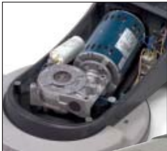
Heavy-duty drive system

The Loline range of low profile floorcare machines has been developed to meet both the growing demand and need for a choice of models that are smaller in size, lighter in weight, compact and convenient in storage whilst, at the same time, being quick and easy to use without loss of performance.