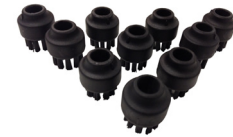
Nylon Brush Pack of 10 x5 supplied as standard