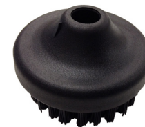
55mm Round Brush