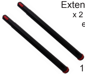
Extension Tubes x 2 supplied with each machine