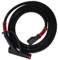
4 Metre Steam Only Hose