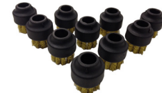
Brass Brush Pack of 10 x5 supplied as standard