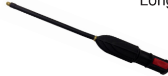
Long Steam Nozzle