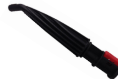
Detail Brush Nozzle