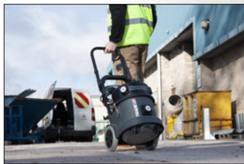
No lifting or carrying