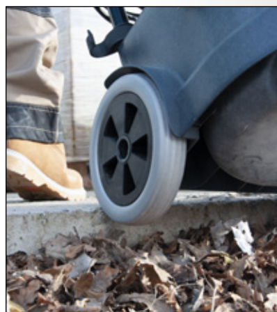
Large, "site-ready" wheels for stairs, kerbs and uneven surfaces