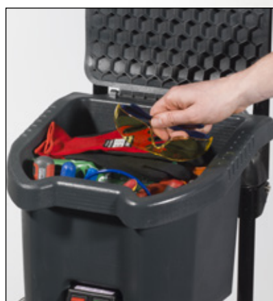
Handy tool storage (optional)