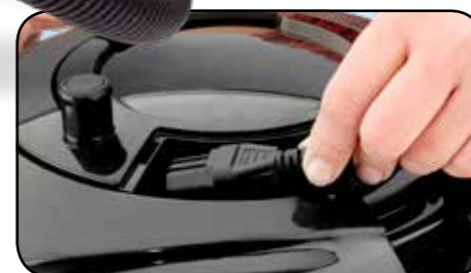
Easy replacement plugged cable system