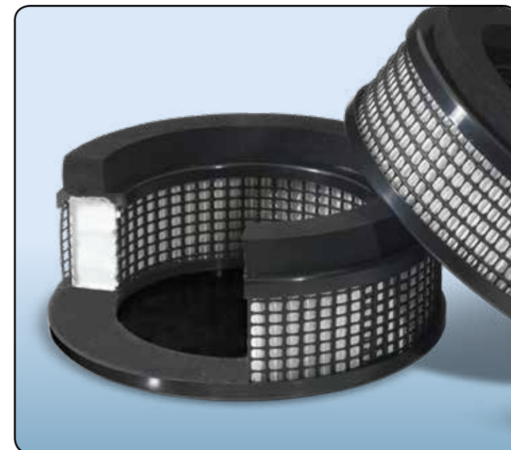
H13 Hepa filtration module (EN1822)