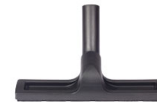
900918 300mm Floor Nozzle £12.90