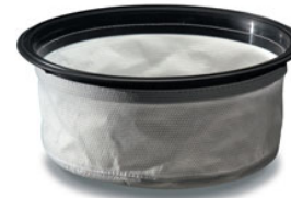
604165 Tritex Filter £19.84