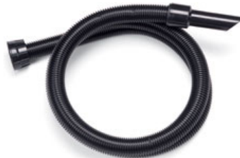
601102 2.9mtr Vacuum Hose £21.83