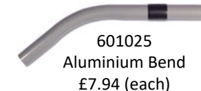
601025 Aluminium Bend £7.94 (each)