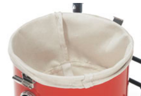
604120 Protectoglass Filter £45.64