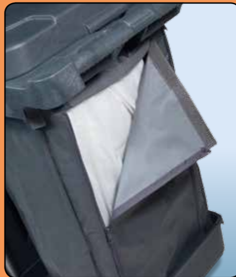
Coverall waste bag system