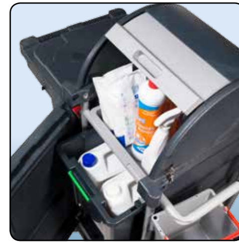
Large storage capacity

The PCG200 is of larger proportions and designed to be equipped with a range of on-board mopping facilities or the detachable MidMop twin 16 litre mobile mopping unit which can be used conveniently, independent of the PCG200 "Mother Ship".