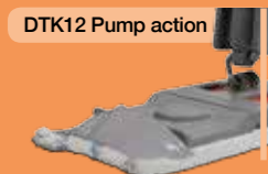
Optional mop kits