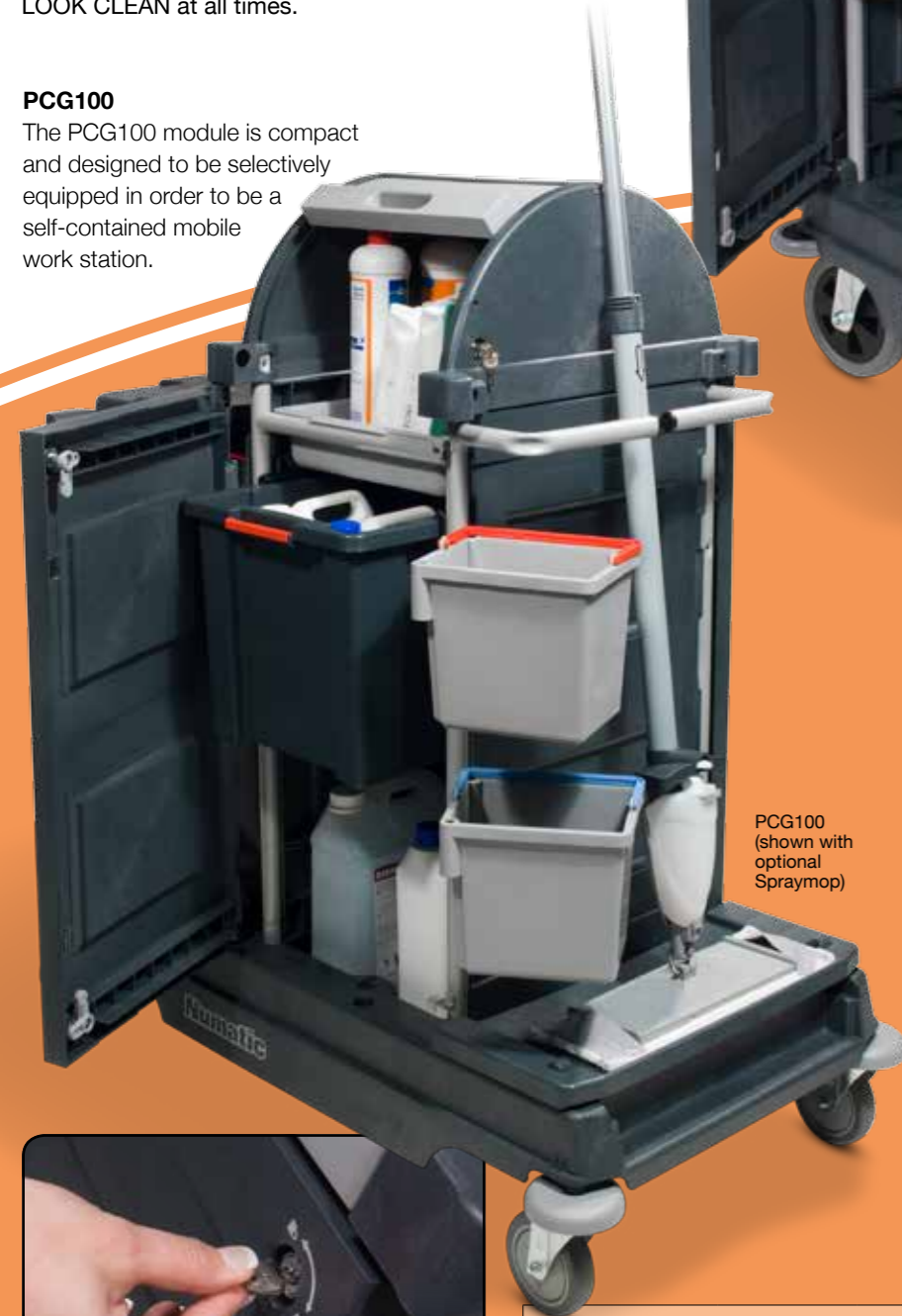
PCG100 (shown with optional Spraymop)

The PCG100 module is compact and designed to be selectively equipped in order to be a self-contained mobile work station.