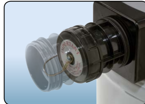
Easy empty extending nozzle