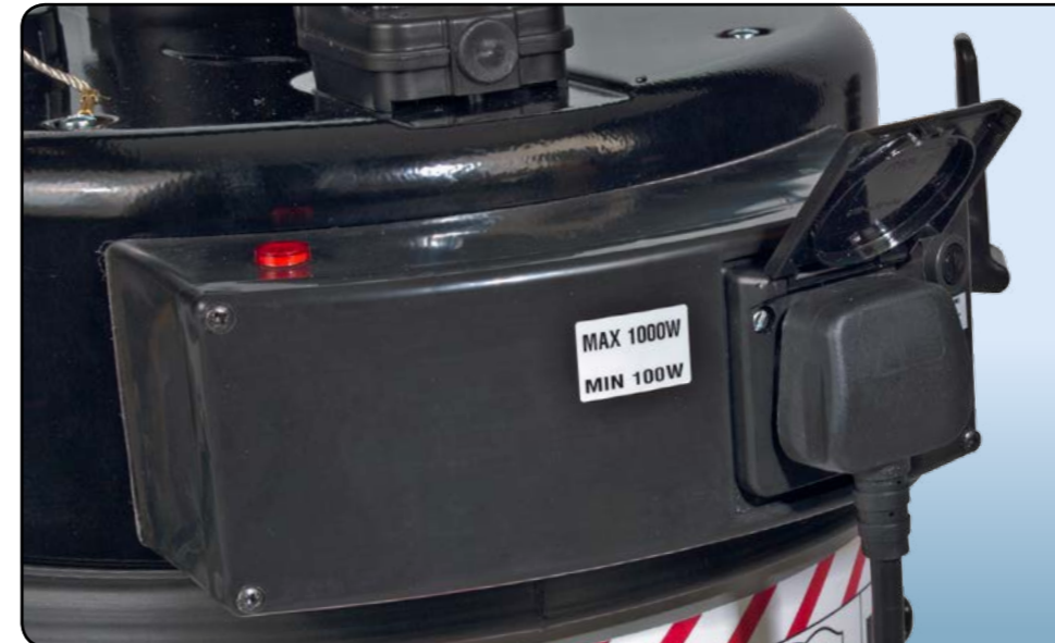
Optional power outlet socket, Simplex 2000W power outlet, Duplex 1000W power outlet