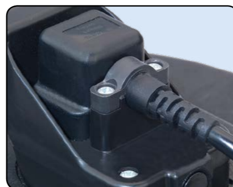
Plugged easy change cable