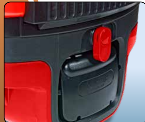
Secure battery lock system