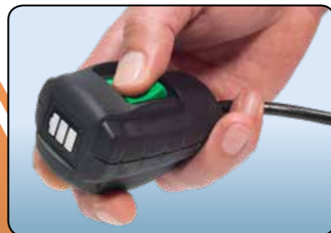
On / Off and charge indicator