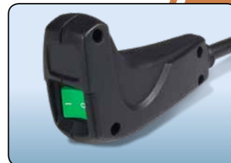
RSV mains hand control

(RSV130 Aircraft RucSac Vac specifications on page 15)