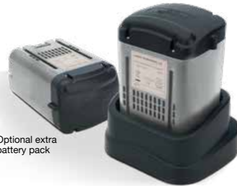
Optional extra battery pack