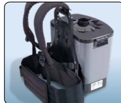
Secure and comfortable harness