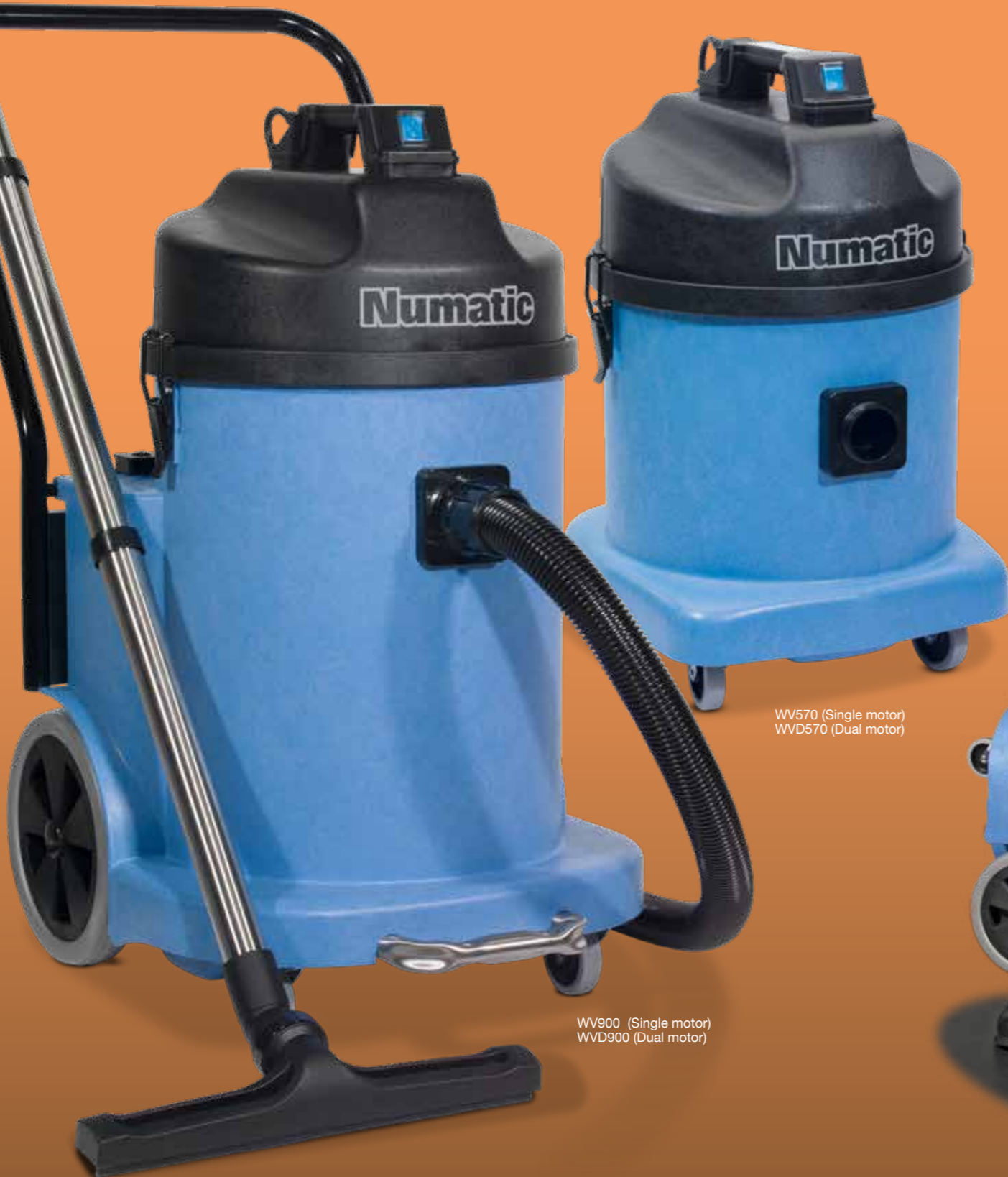
WV570 (Single motor) WVD570 (Dual motor)

EcoWets have now been raised to our full 38mm (1½") standard, providing performance enhancements allowing single motor models to perform to improved standards. Both models use complete Structofoam construction, an exceptionally tough compound that doesn't dent, scratch or deteriorate and yet it is lightweight and resists all standard cleaning chemicals.