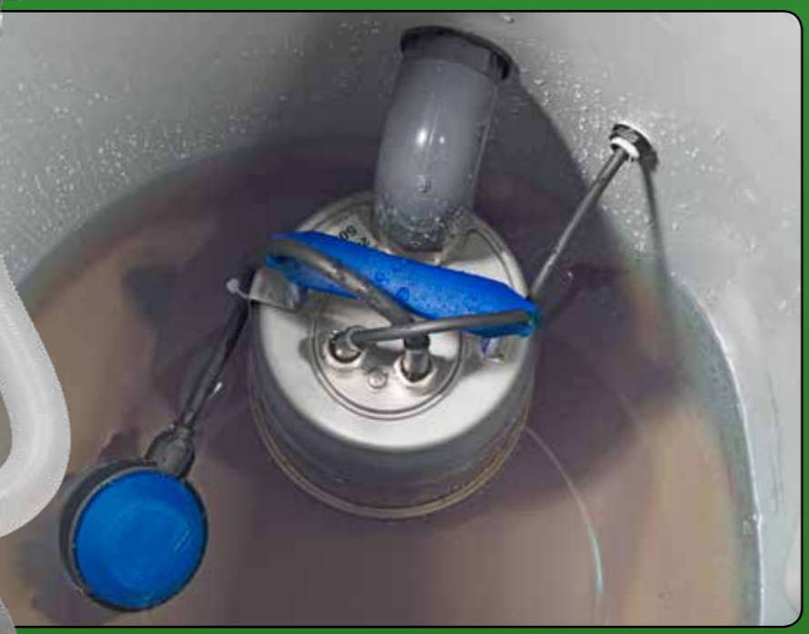
AP submersible pump system