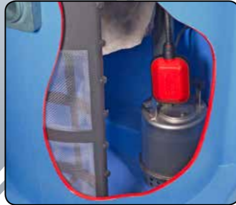
Auto submersible pump (AP model)