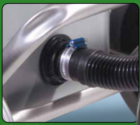
WVD2000DH Dump hose