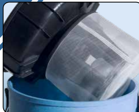
Giant wet and dry primary basket filter