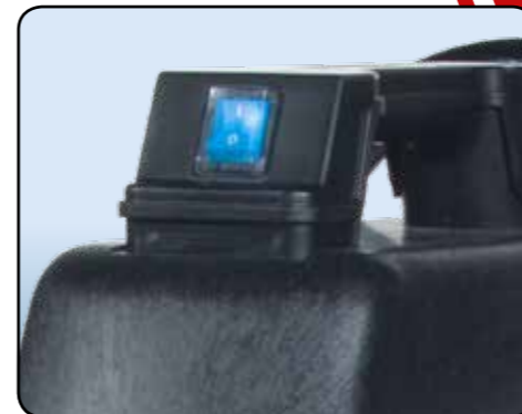
Simple on / off switch