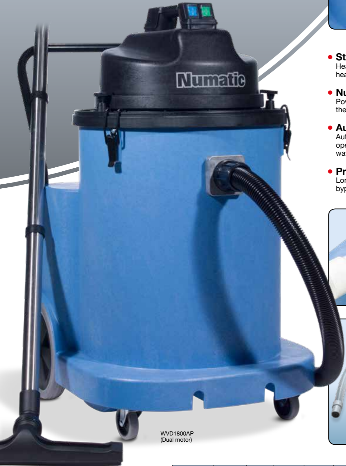
WVD1800AP (Dual motor)

The power head is fully Structofoam by design, incorporating TwinFlo 2-stage bypass motors and the Nucable plugged replaceable cable facility is an added feature.