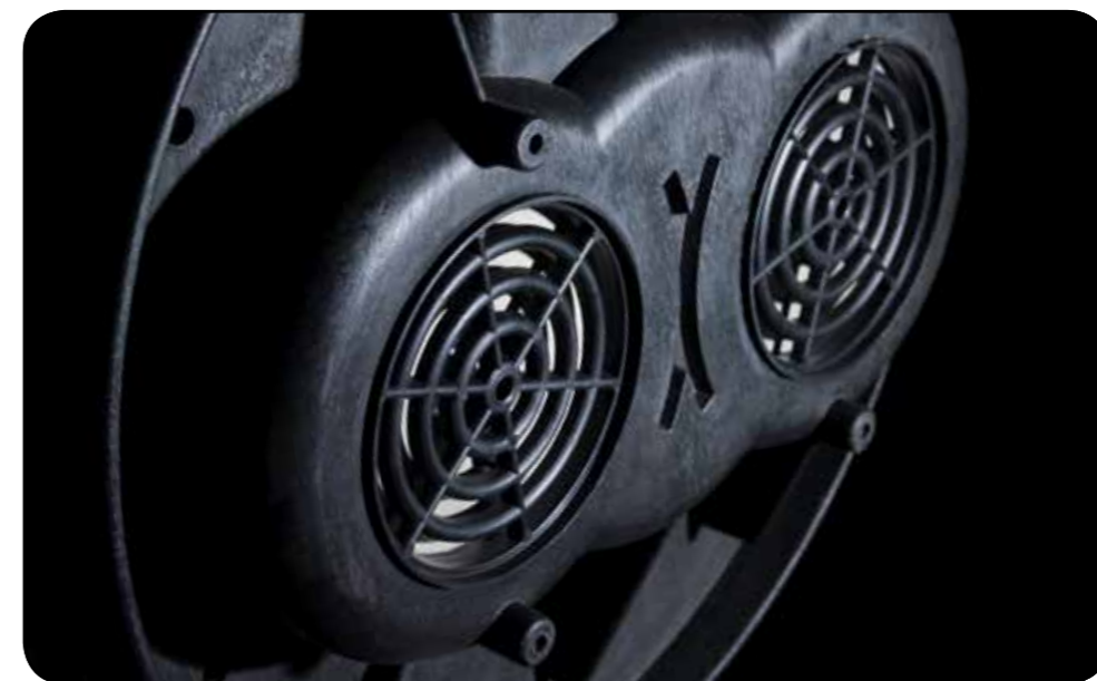
Twin motor power option