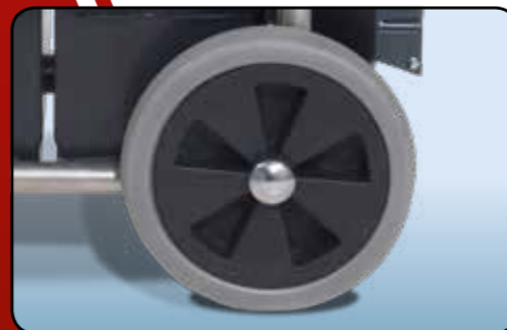
Large transit wheels