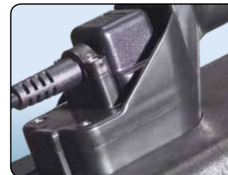
Nucable easy replacement plugged cable system