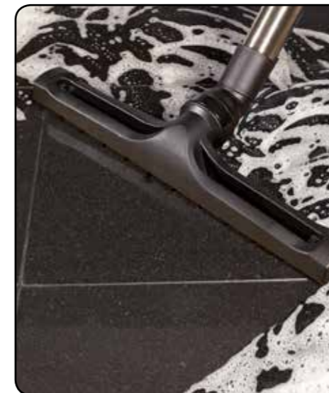
400mm wet pick-up nozzle