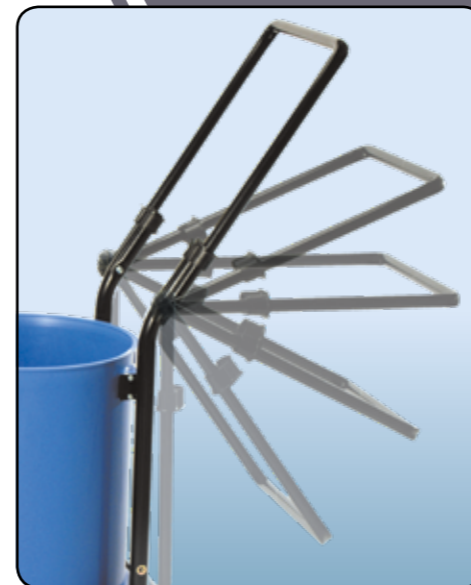
Fold down transit handle WV470