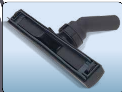
High efficiency ProFlo wet floor tool