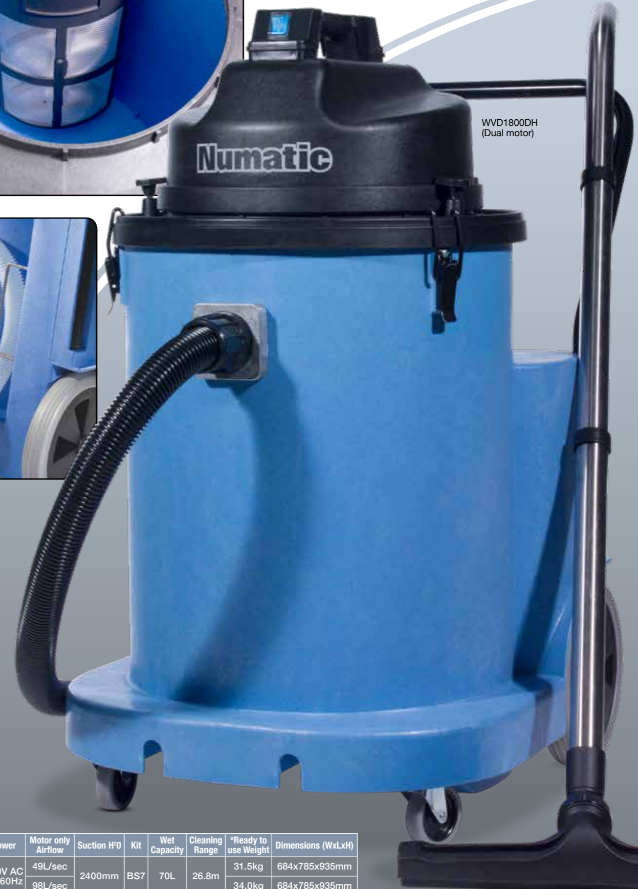
WVD1800DH (Dual motor)