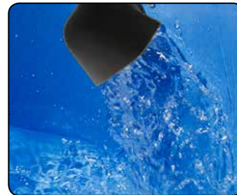
Wet and dry system