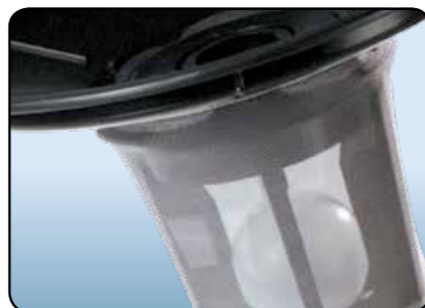
Safety net filter and float assembly