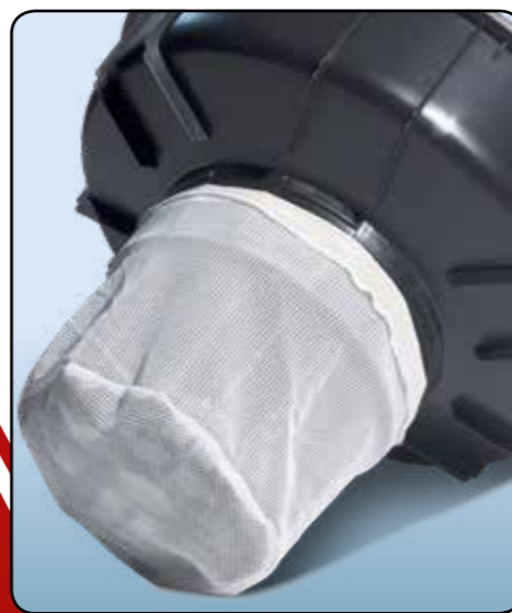
Safety net filter and float assembly