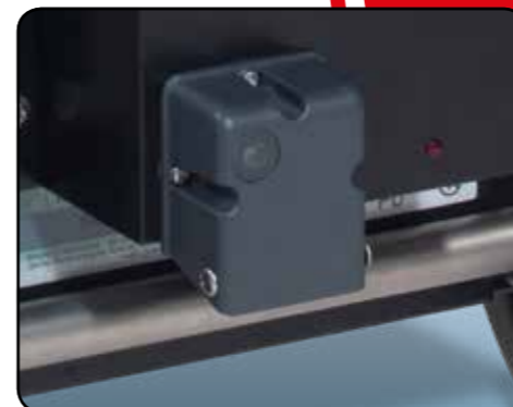
On-board charger, easily accessible