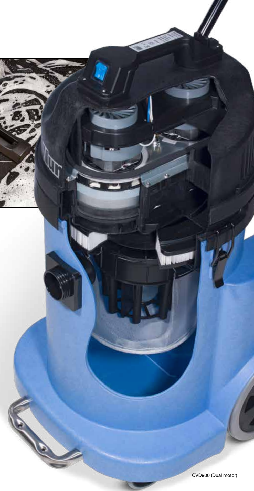
CVD900 (Dual motor)