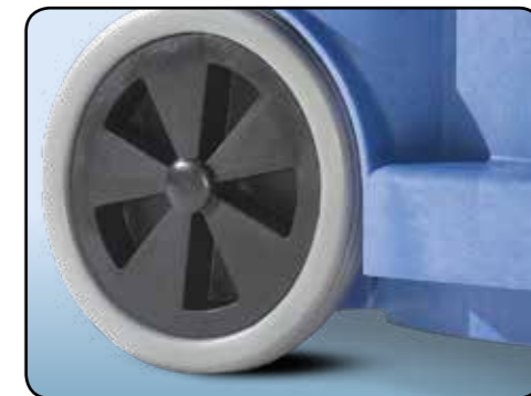
Large 250mm rear wheels