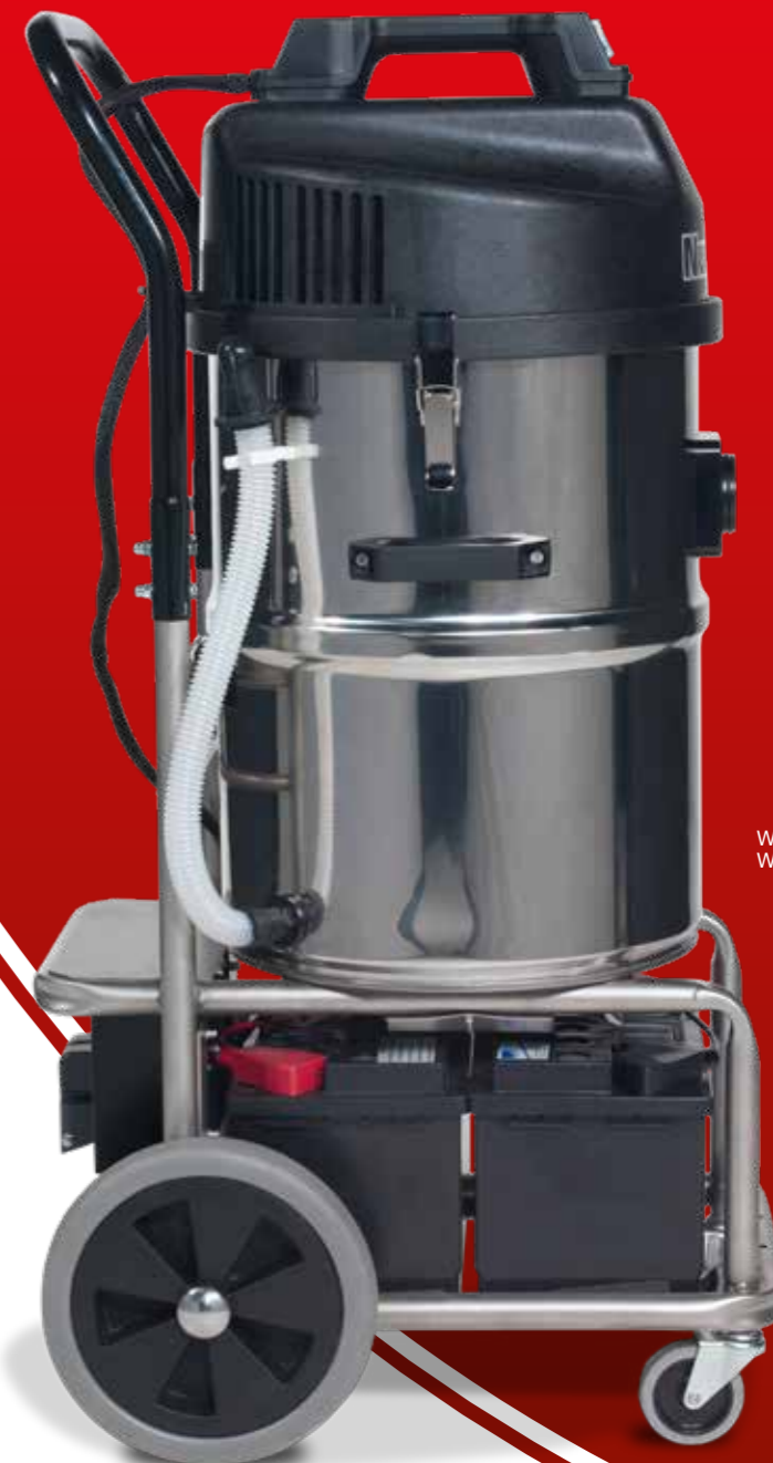
WVB750 (Simplex) WVDB750 (Duplex)