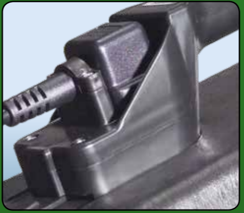
Nucable easy replacement plugged cable system