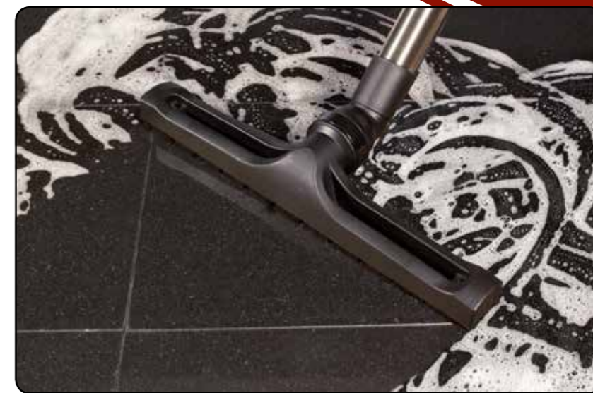
Clean, dry floors again and again