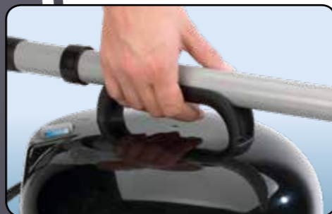
Convenient easy carry handle