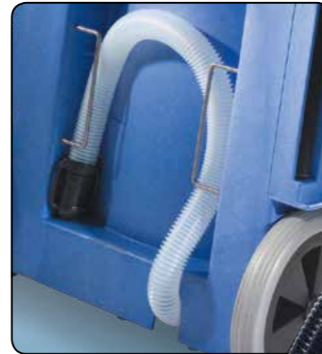
Rear dump hose (DH Models)