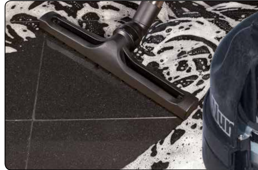
Clean, dry floors again and again