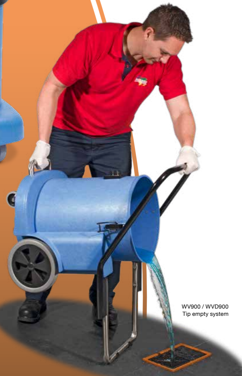
WV900 / WVD900 Tip empty system