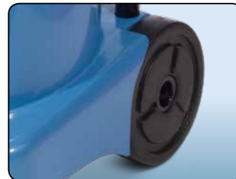
Large rear wheels