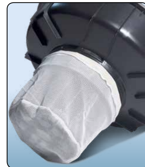
Safety net filter and float assembly