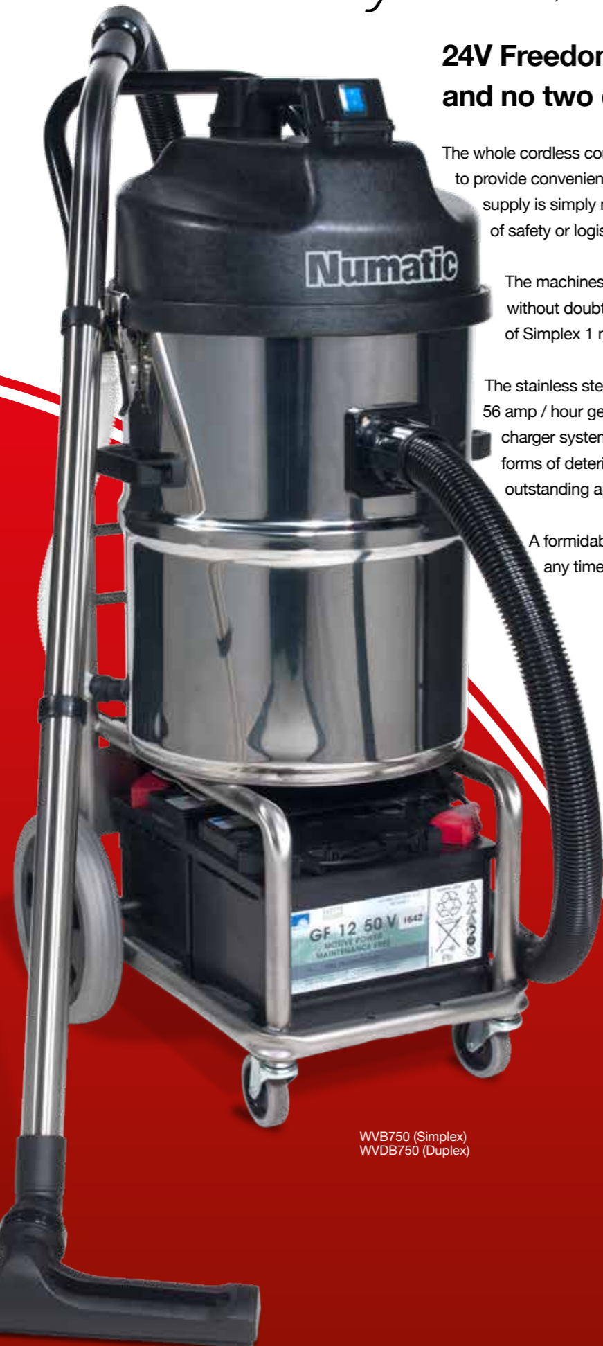
WVB750 (Simplex) WVDB750 (Duplex)

A formidable cordless package that will go anywhere, any time.