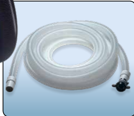
10m Discharge hose for AP