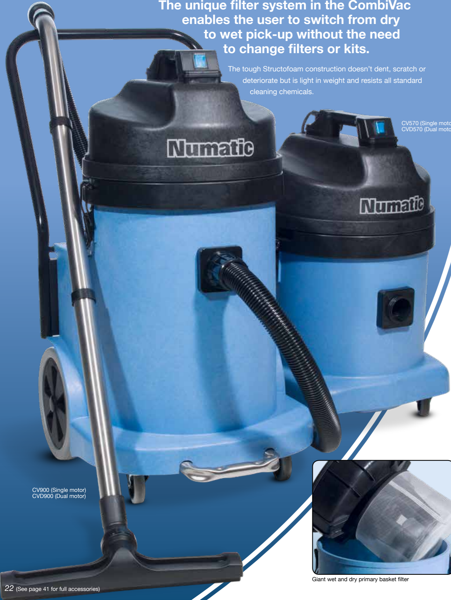
CV570 (Single motor) CVD570 (Dual motor)

The tough Structofoam construction doesn't dent, scratch or deteriorate but is light in weight and resists all standard cleaning chemicals.