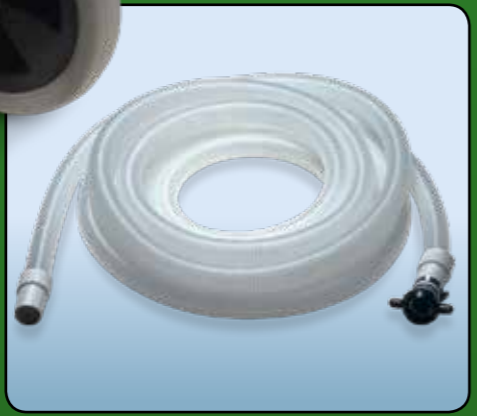
10m Discharge hose for AP