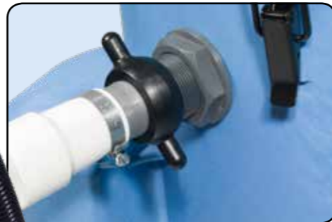
Rear discharge outlet (AP Model)