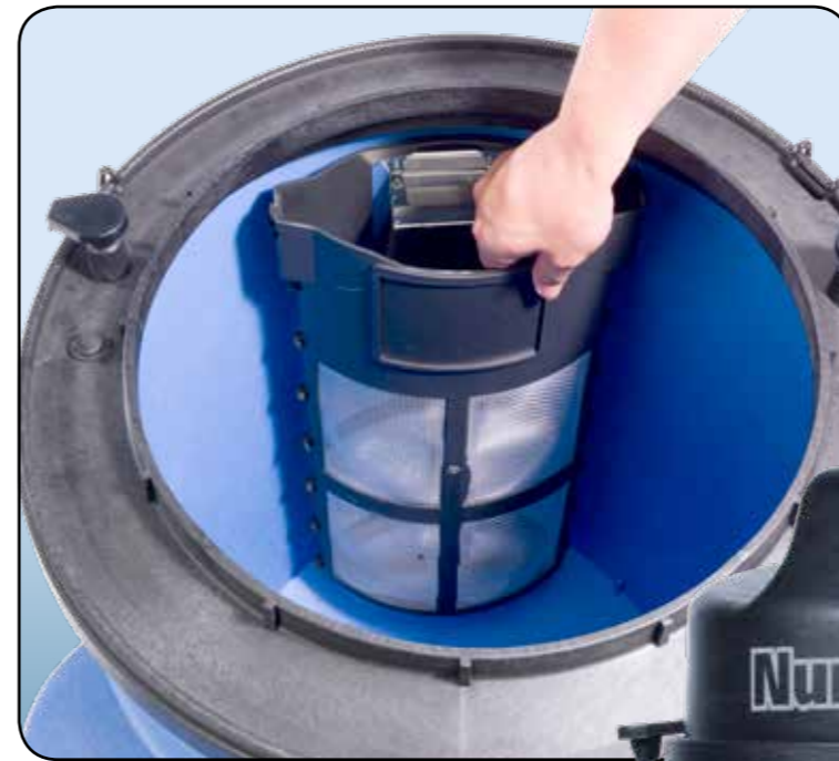
Safety trash basket