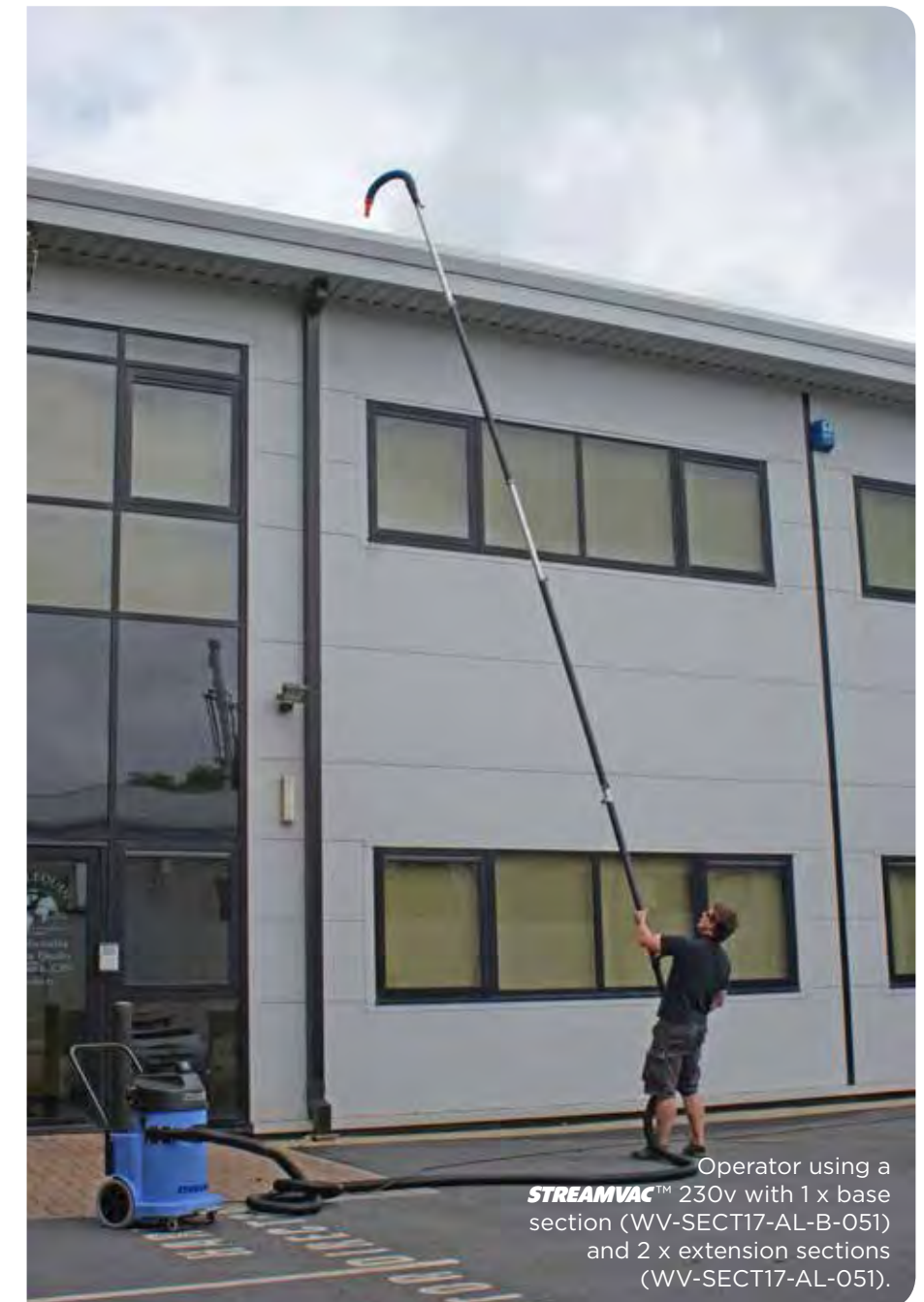
Operator using a STREAMVAC™ 230v with 1 x base section (WV-SECT17-AL-B-051) and 2 x extension sections (WV-SECT17-AL-051).

Large rear wheels for easy manoeuvring over rough terrain.