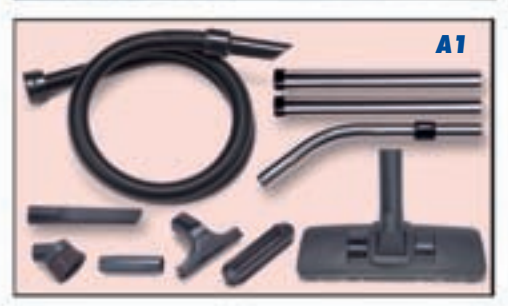
Also available 115V/120V specification.