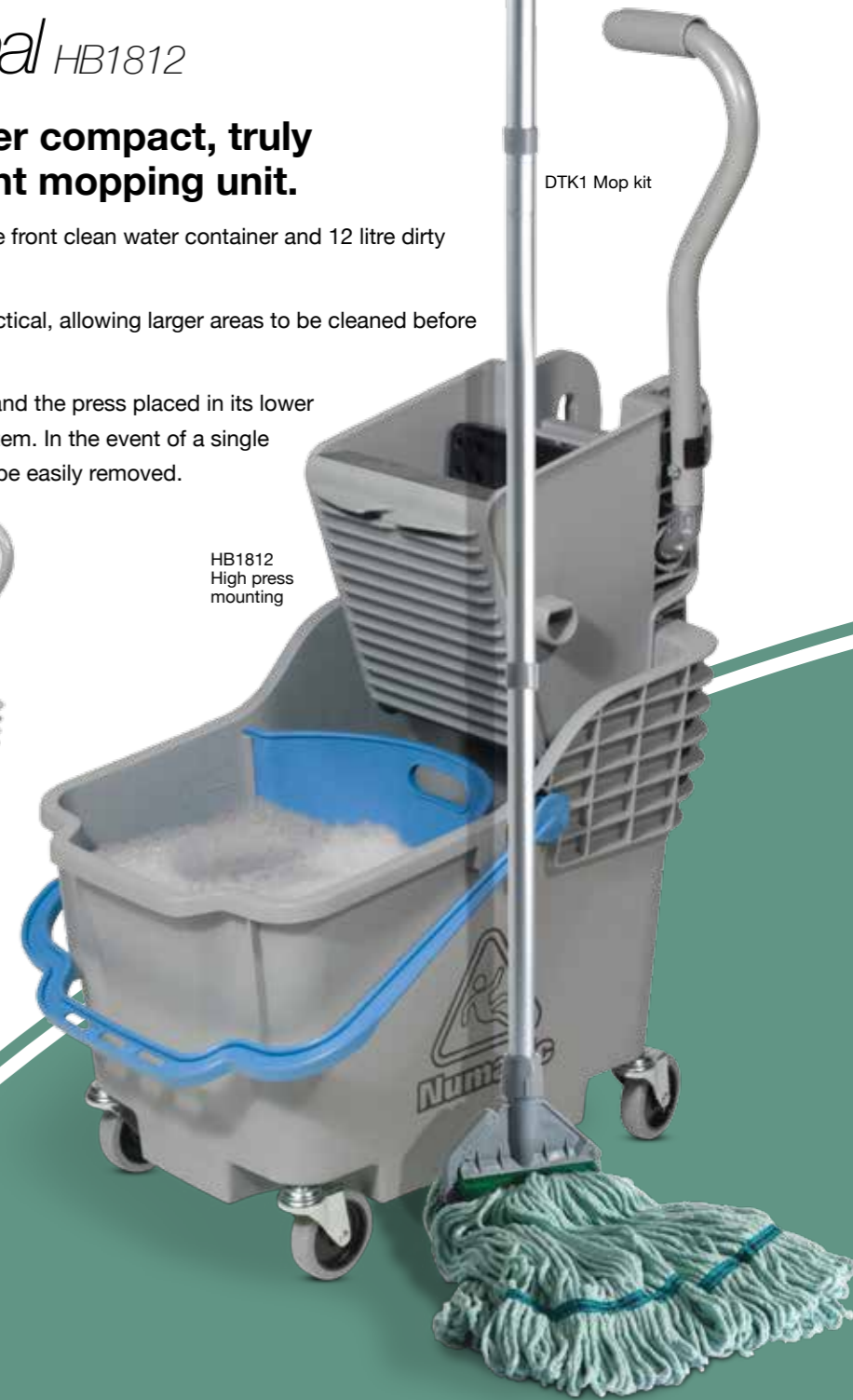
DTK1 Mop kit