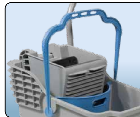
Folding sturdy handle