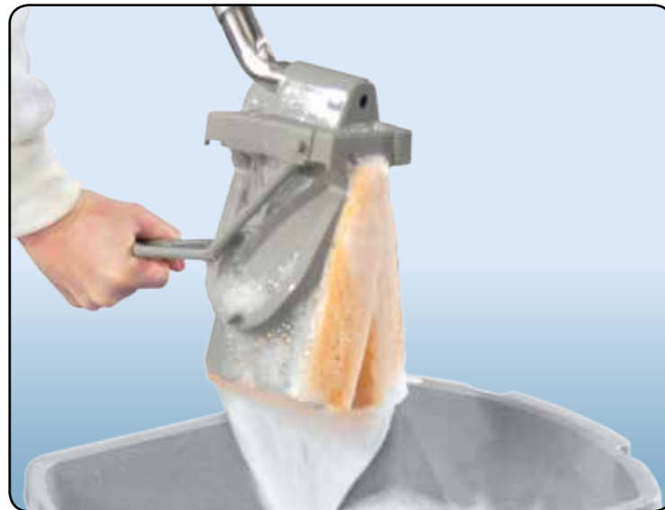
Folding press and self-cleaning system