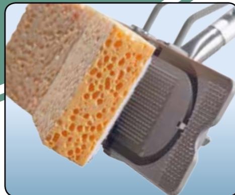
Easy velcro mop attachment