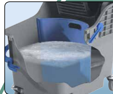
Parabolic water separator