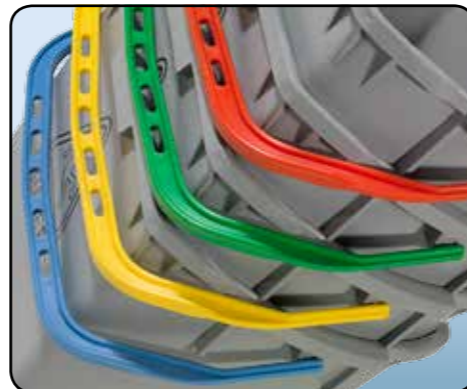
Colour coded handles