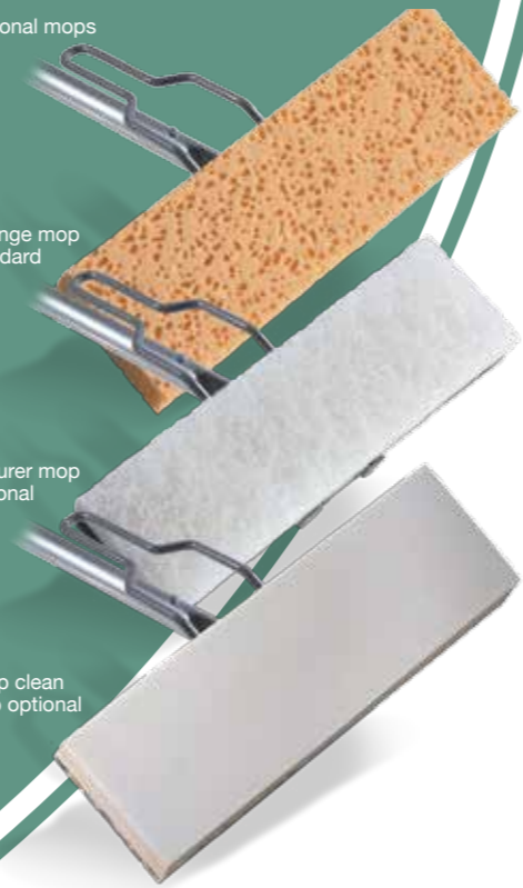
Deep clean mop optional