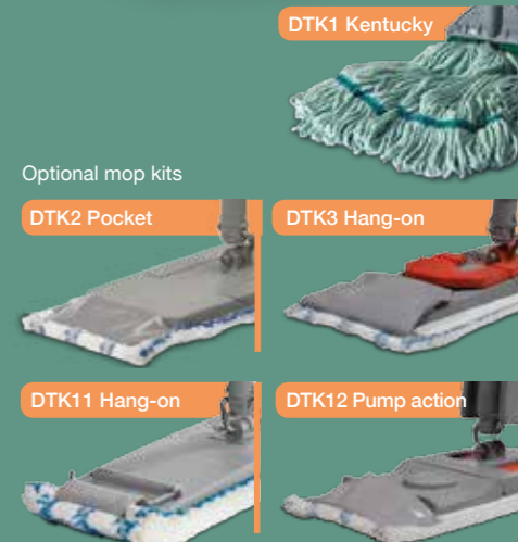
DTK12 Pump action

See pages 26-29 for full mop kits, holders and mops