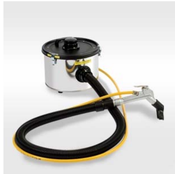
KAV 2 with optional Interceptor Tank

Please note power requirement - do you have sufficient compressed air to spare?