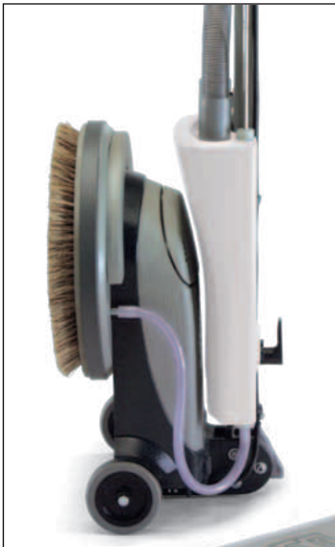
Slim Folded Profile