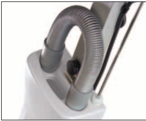
Large Solution Tank

With this machine running at an operating speed of 150rpm it is a genuine taskmaster, satisfying a whole host of floor maintenance needs, be it polishing or scrubbing.