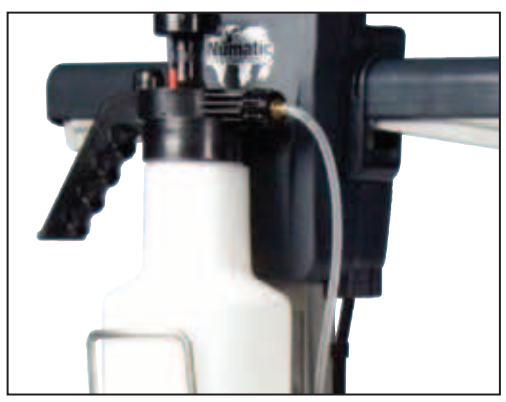
Optional SimpliSpray System