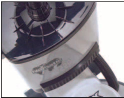
Option Dustrol Vacuum System