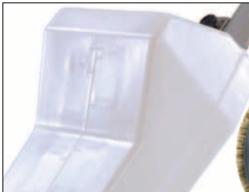
Large Solution Tank