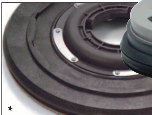
Flexi Pad Drive System