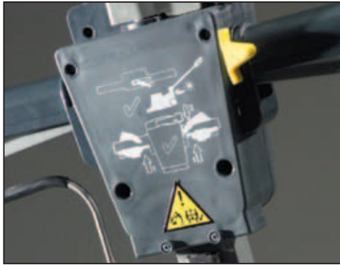
Simple to Use Operator Handle