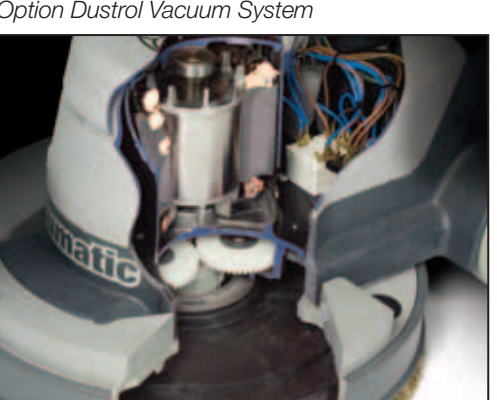
Hi-Tech and Robust